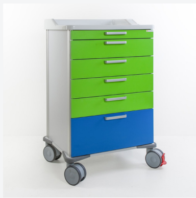
Medicart Drawers Standard & Small