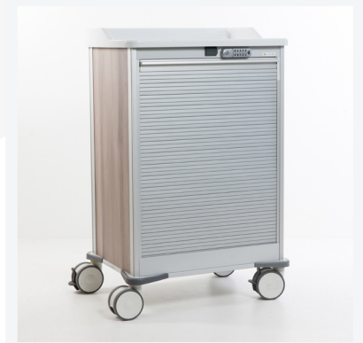
Medicart Roller Shutter